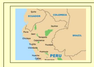
Nearly every banana grown in northern Peru is certified organic

“...this is totally revolutionary what we are doing.”